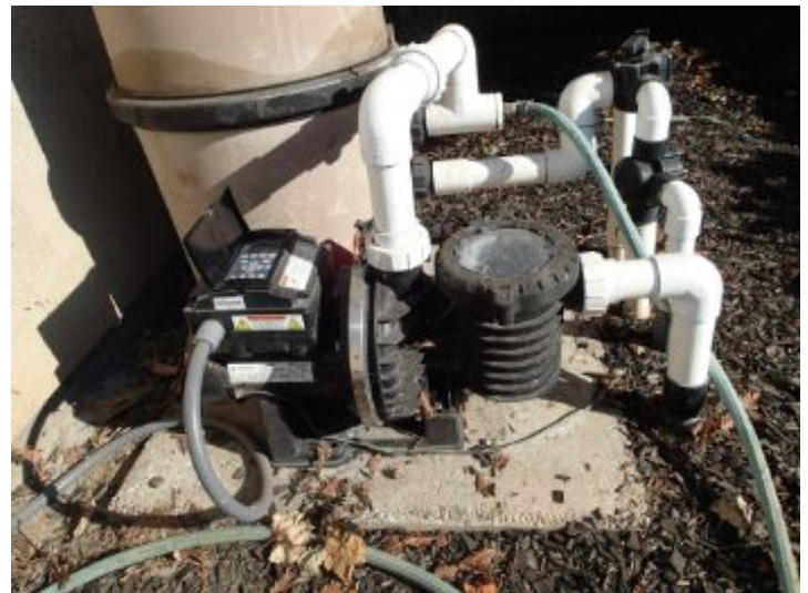
The pump is newer. It was operated, and no deficiencies were noted at the time of inspection.