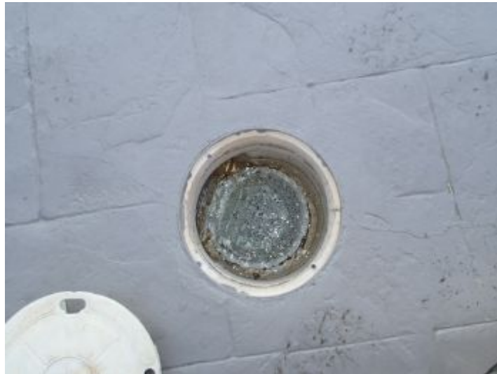
Skimmer, and baskets appear functional.