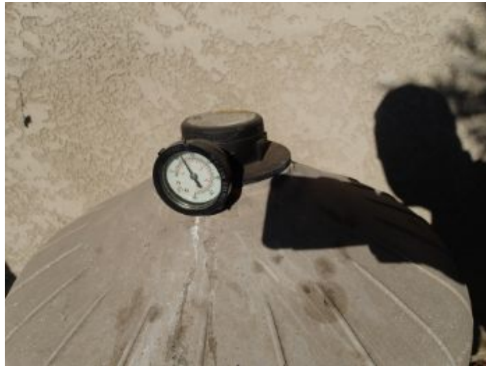
Present on filter housing.