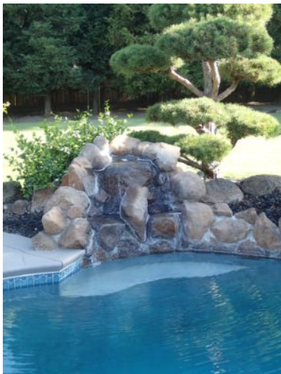
Waterfall operated properly at the time of inspection.